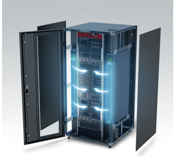
2 Cooling Units / 1 rack (Redundant Application)