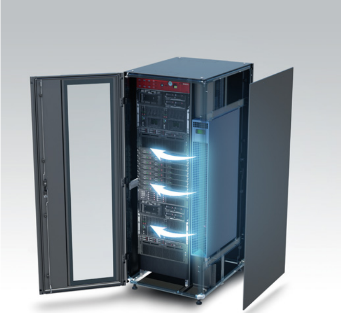
1 Cooling Unit / 1 Rack