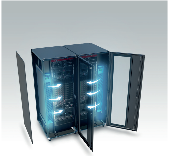
2 Cooling Units / 2 Racks (Redundant or Shared Application)