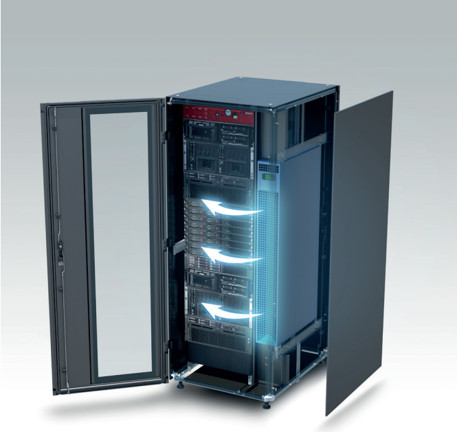
1 Cooling Unit / 1 Rack