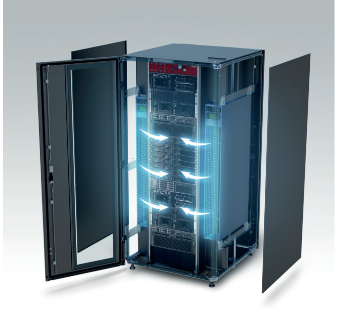
2 Cooling Units / 1 rack (Redundant Application)