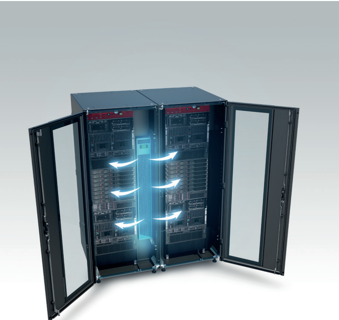
1 Cooling Unit / 2 Racks (Shared Application)